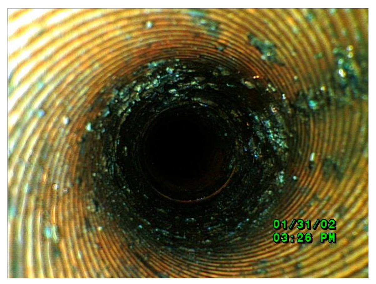
Fiberoptic Scoping reveals severe deposition and corrosion.

Sludge or large amounts of dirt and debris in cooling tower basins or sumps are another indication of potential problems during operation. Much of this material can be transferred throughout the system, especially to the enhanced tubes. Extraneous dirt and debris can settle into the internal rifling and cause fouling and differential corrosion cells, resulting in pitting of the tubes.