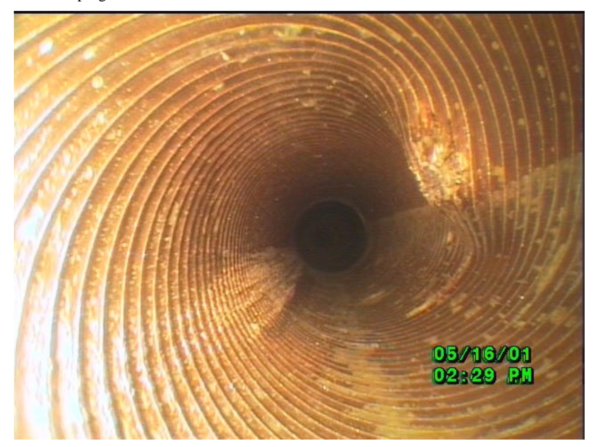
Internal rifling of an enhanced tube is shown with damage to right side of tube.

Another side of these enhanced tube geometries result from the small crevices that are created in the rifling of the tubes. Even though the greater flow turbulence will ultimately aid in the increasing heat transfer and minimize fouling at velocities above 3 ft/sec,<sup>10</sup> the small crevices that are introduced to the inner tube surface are ideal spots for deposition to occur when tube velocities fall below 3 ft/sec. These small, pocket-type, areas also make it more likely for the deposition to occur. It is important for the water treatment professional to recognize these potential problems and to take appropriate steps in the development of an appropriate water treatment program.