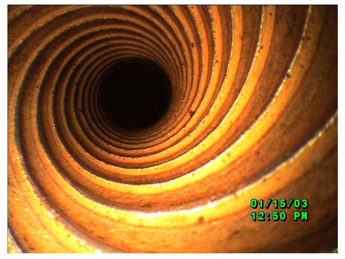
Internal riflings of enhanced tube are shown with some pitting.

One representative of a major chiller manufacturer indicated his major concerns were with water quality. He stated that a side-by-side