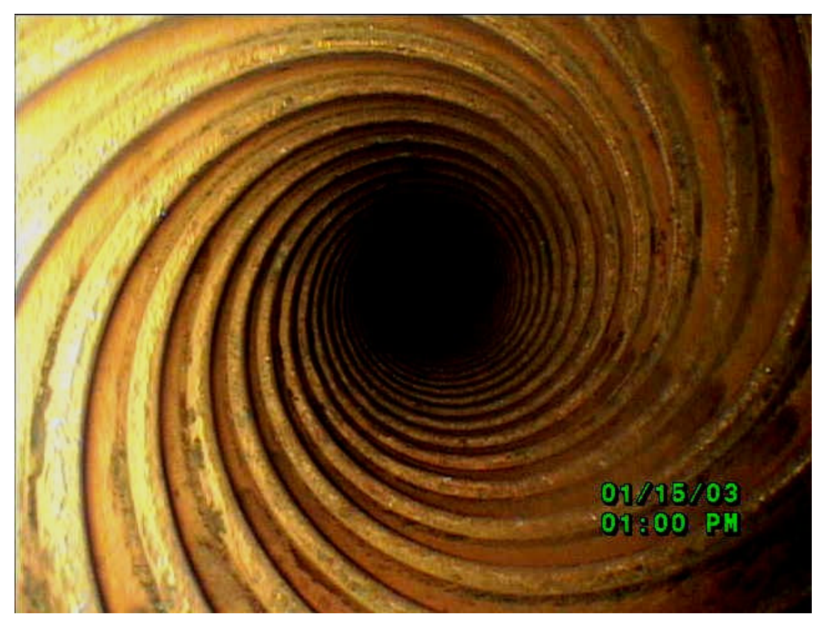
Enhanced tube is shown with deposition products in crevasses.

Water treatment professionals must know the type of tube that is in the equipment before they can design a water treatment program.<sup>17</sup> Many operators may not be aware of the type of tubes in their system. Professionals can obtain heat exchanger or chiller part serial numbers and contact the equipment manufacturer as the first step in determining if their system has enhanced tubes.